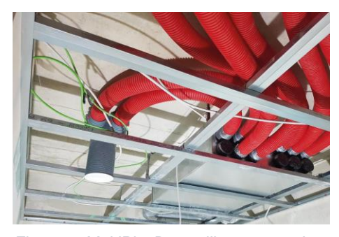
Figure 3: MultiPlexBox ceiling mounted