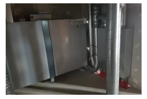
Figure 2: Standalone MVHR unit

The single main MVHR unit is installed into the basement of the property. The MultiPlexBoxes will be responsible for regulating the airflow levels in the property. They are wall and ceiling mounted. The products were commissioning using the Modbus network functionality from a single laptop.